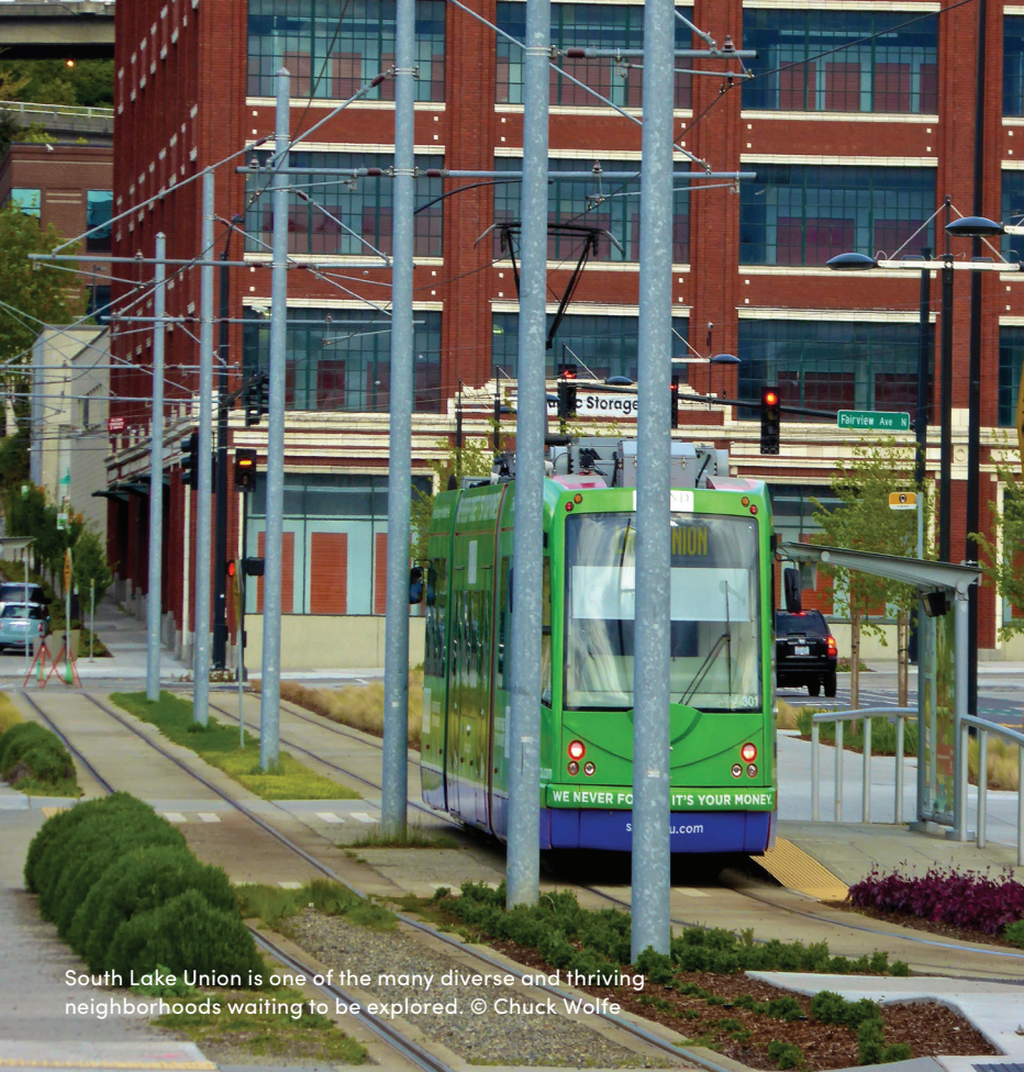
South Lake Union is one of the many diverse and thriving neighborhoods waiting to be explored.