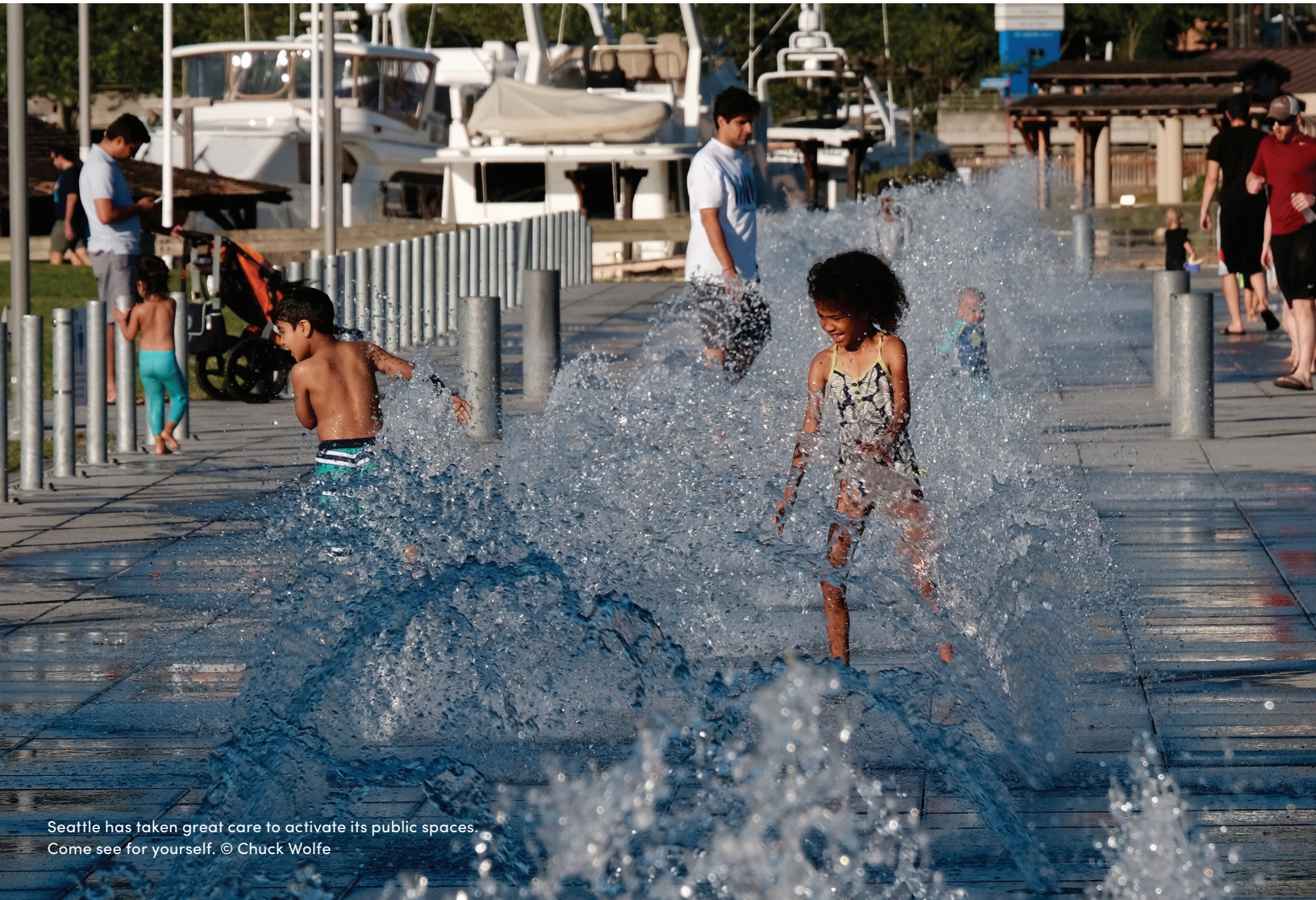
Seattle has taken great care to activate its public spaces. Come see for yourself.