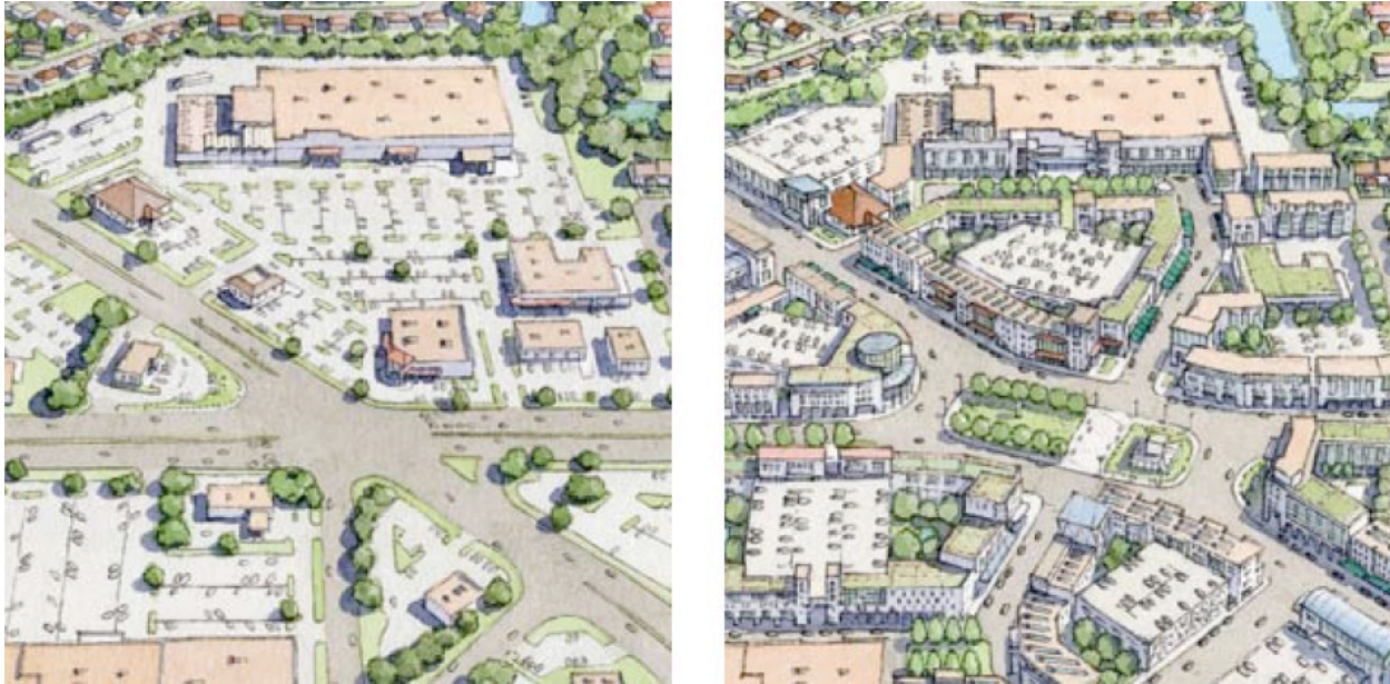
Before-and-after of a typical retrofit for a sprawling “strip mall” district into a vibrant mixed-use town center. (Galina Tachieva, from The Sprawl Repair Manual)

quality development. By adding customers for vibrant, well-designed new centers, suburbs can support more attractive commercial and civic amenities. If managed correctly, the process can become a “virtuous circle” – the additional customers support higher-quality development, which attracts additional customers, and so on.