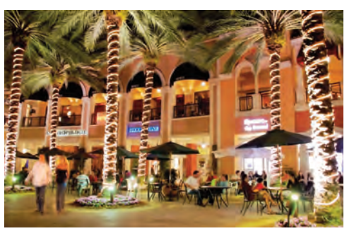
This information is available at these websites: 1. www.westpalmbeach.com/history.html 2. www.cityplace.com/info/media/10th Anniversary

Outside of CityPlace, over 3,000 new residential units were built in the last decade. breathing life back into the downtown. After much debate, the public library moved up Clematis Street from its original waterfront location to Dixie Highway to co-locate with a new City Hall. A new waterfront & City Commons was unveiled in 2010. Multi-agency efforts have been underway for several years to re-introduce passenger rail service on the FEC. With almost 100,000 permanent residents, West Palm Beach is the largest community in Palm Beach County and the seat of its county government and, once again, boasts a vibrant, growing downtown and a promising future.